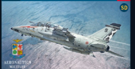
1471 AMX-T 1:72