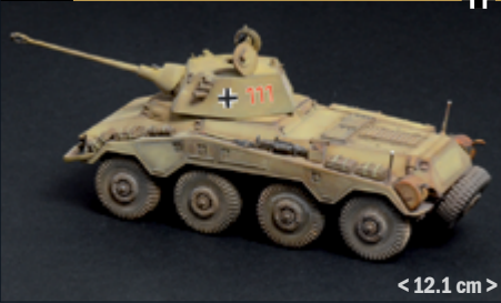
25753 Sd. Kfz. 234/2 Puma