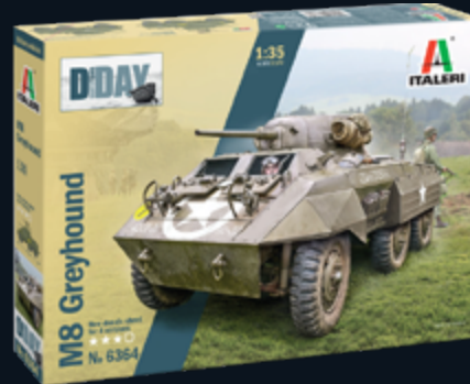
6364 M8 Greyhound 1:35 ★

Il 2024 rappresenta una data importante per commemorare un evento che ha cambiato la Storia Europea e Mondiale: lo sbarco da parte degli Alleati sulle spiagge della Normandia il 6 giugno del 1944. Per celebrare gli ottant'anni dallo storico evento Italeri ha sviluppato una linea, caratterizzata dal logo D-Day 1944-2024 e da un "packaging" dedicato, che comprende alcuni tra i veicoli militari più significativi impiegati, da entrambi gli schieramenti, durante l'operazione "Overlord". Dai mezzi da sbarco Alleati ai più celebri "Panzer" tedeschi una collezione completa che coniuga la passione modellistica e l'interesse per la Storia.