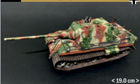
25770 Sd.Kfz. 186 Jagdtiger