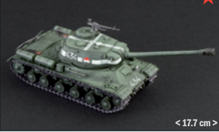
25764 Josef Stalin JS-2