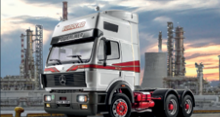
backagain < 27.0 cm >