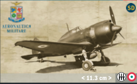
1472 Reggiane Re.2002 Ariete 1:72