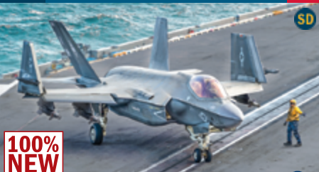
1469 F-35C Lightning II 1:72