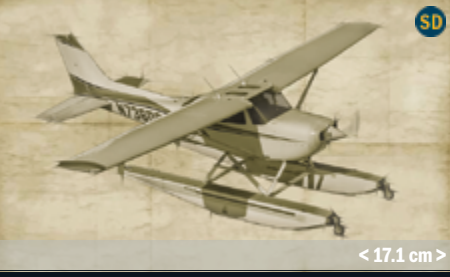
2832 Cessna 172 Floatplane 1:48