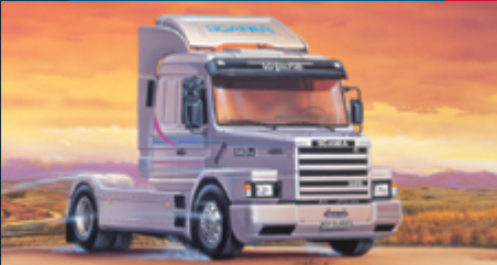
backagain < 24.0 cm >