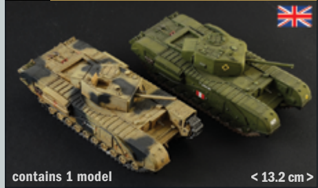
25760 Churchill Mk. III/III75mm/IV/AVRE/V/NA75/6