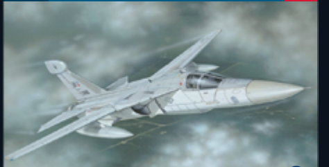
1235 EF-111A Raven 1:72