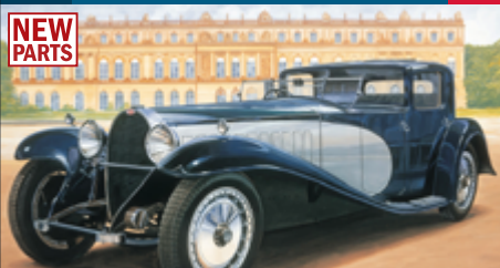
New rubber tyres < 24,5 cm >