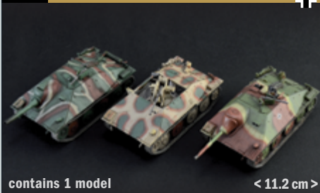
25767 Jagdpanzer 38(t) Hetzer