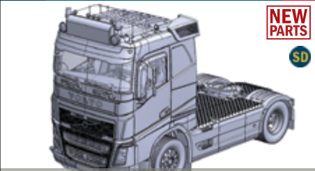
< 25.4 cm >