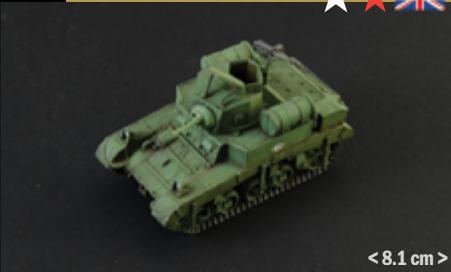
25761 M3/M3A1 Stuart