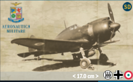
2806 Reggiane Re.2002 Ariete 1:48