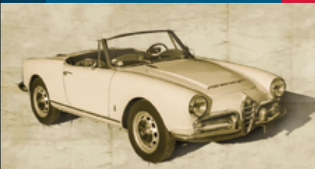
< 16.2 cm >