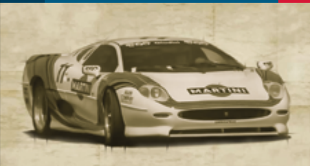
< 20.5 cm >