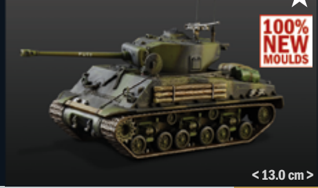
25772 M4A3E8 Sherman "Fury"