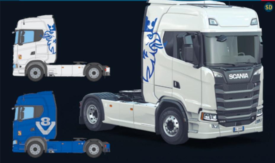
Decals sheet for 2 versions < 24.7 cm >