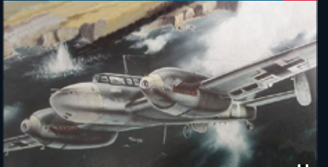
049 Bf-110 C3/C4 Zerstörer 1:72