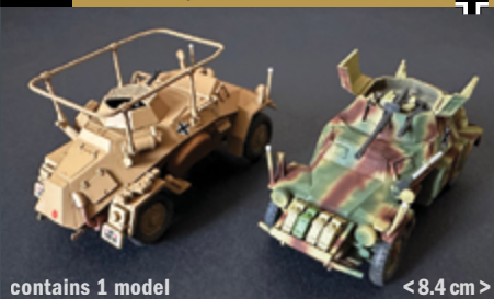
25769 Sd. Kfz. 222/223