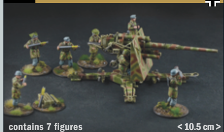
25771 8.8 cm Flak 37 with crew