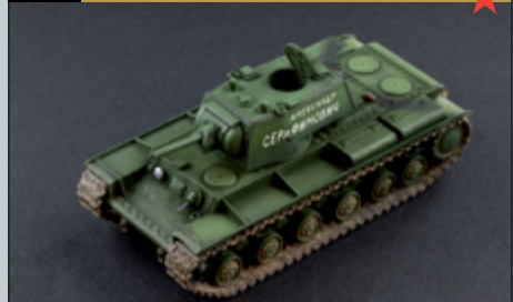
25763 KV-1 / KV-2 contains 1 model