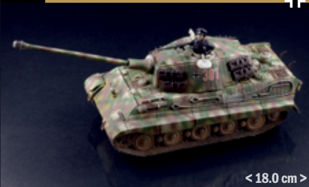
25765 Sd. Kfz. 182 Tiger II