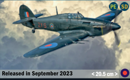
2828 Hurricane Mk.IIC 1:48