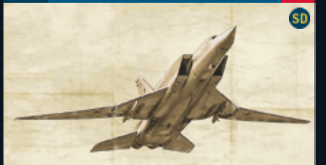
1440 Tu-22M3 Backfire C 1:72