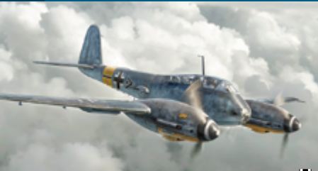
074 Me 410 A-1 "Hornisse" 1:72