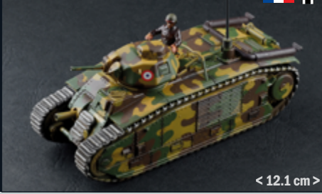
25766 Char B1 Bis