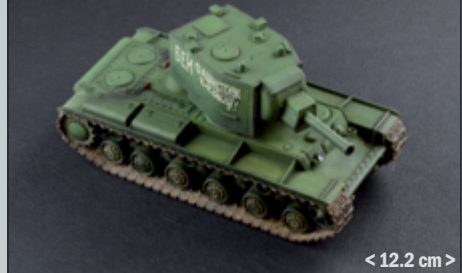
25766 M18 Hellcat