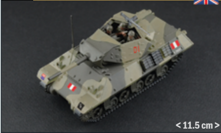
25758 M10 Tank Destroyer