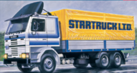
backagain < 32.5 cm >