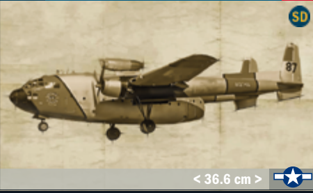
1473 C-119G air tanker 1:72