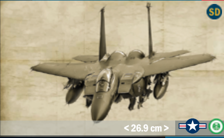
1475 F-15E Strike Eagle 1:72