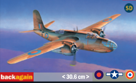
2656 A-20B / Boston III 1:48