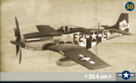
2831 P-51D/K ET0 Aces 1:48