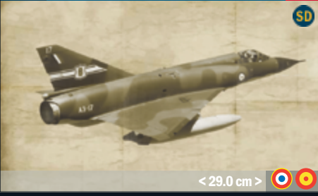
2816 Mirage III E 1:48