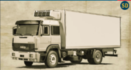
< 38.0 cm >