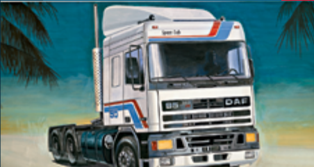
backagain < 28.5 cm >