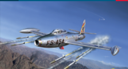
1321 F-84G Thunderjet 1:72