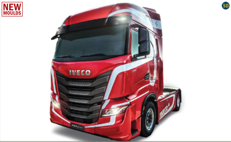
< 24.6 cm >