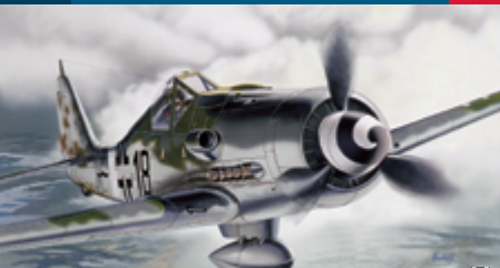
1312 FW-190 D-9 1:72