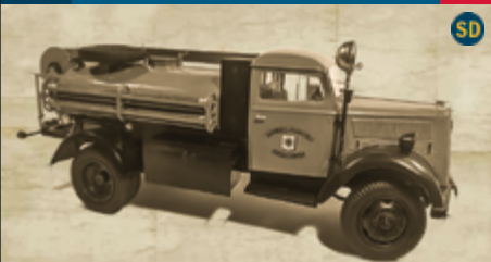
< 24.9 cm >