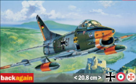
2645 G91 R1/3/4 "Gina" 1:48