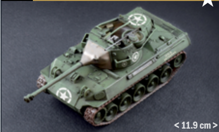
25762 M18 Hellcat