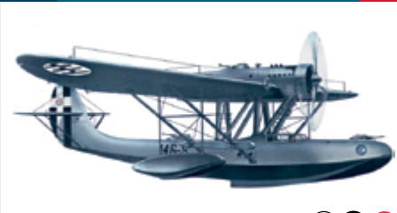
112 CANT Z.501 Gabbiano 1:72