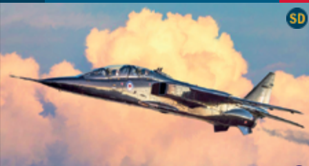
1470 Jaguar T.2 R.A.F. Trainer 1:72